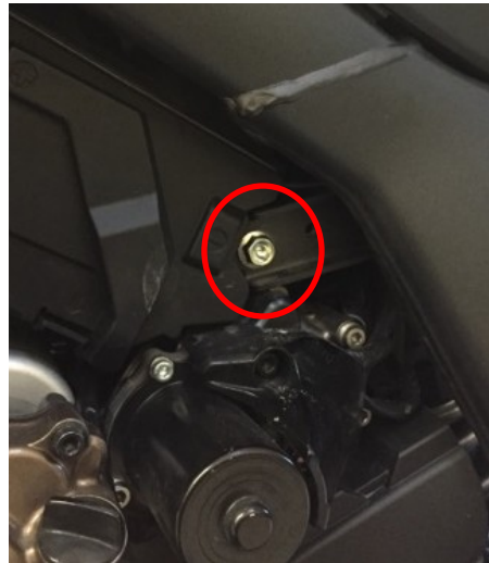
Figure 1: Rear Engine Mount Bolt

Step 2: Now remove the bottom and rear most bolts from the front engine mount, See Figure 2 . There is also a spacer on the rear bolt of the front engine mount. Keep track of this spacer as it will be used for reassembly.