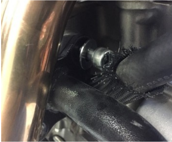
Figure 5: 10x120mm Bolt

Step 5: Once the most forward and rear bolts are in place, place an 10mm Hardened Flat Washer on the 10x120mm SHCS and begin to run it through the rear bolt hole on the front mount of the guard. Make sure the factory spacer is in place before pushing the bolt completely through the mount.