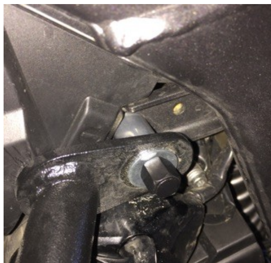
Figure 4: 8x285mm HHCS and Spacer