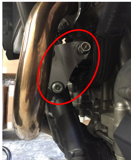
Figure 2: Front Engine Mount Bolts

Step 2: Now remove the bottom and rear most bolts from the front engine mount, See Figure 2 . There is also a spacer on the rear bolt of the front engine mount. Keep track of this spacer as it will be used for reassembly.