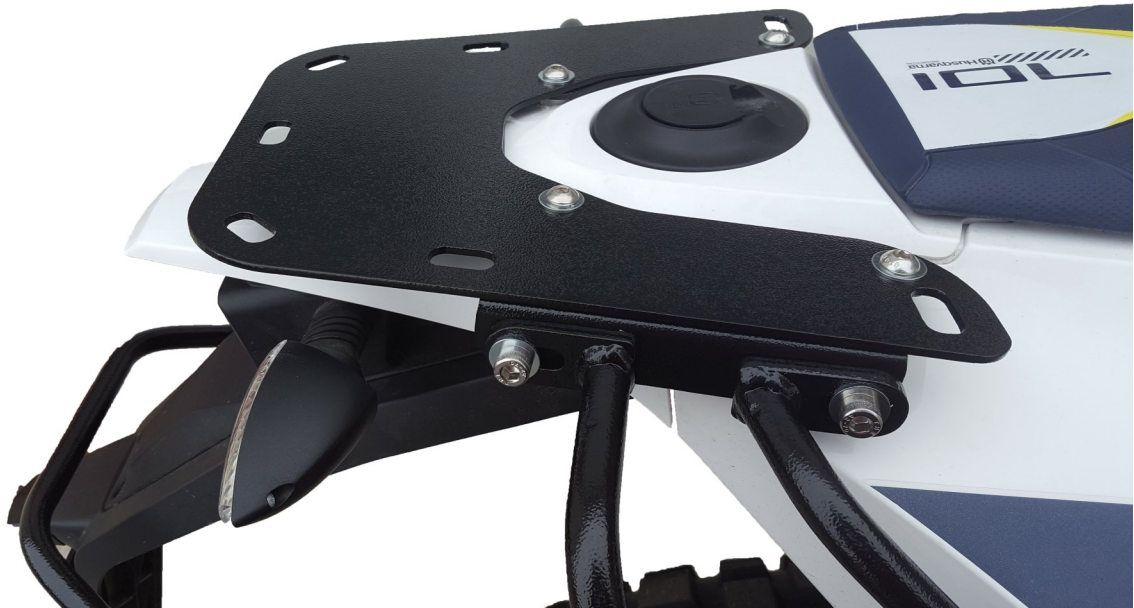
Figure 4: The top plate mounted with the SU rack.

Installation is complete! To ensure that the top plate keeps it's longevity, check all bolts for quality and tightness before each adventure. Ride safe & Thank you for choosing Happy Trails Products, we appreciate your business.