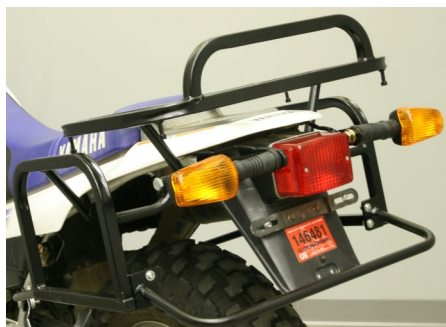
Note picture shows SU rack, SL rack does not have rear support bumper.