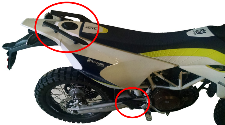
Figure 1: Grab handles and heal guard circled in picture.

Note: If you are using the factory grab handles and no Happy Trails tail plate, proceed to step 2. If you are using the Happy Trails top plate, proceed to step 3