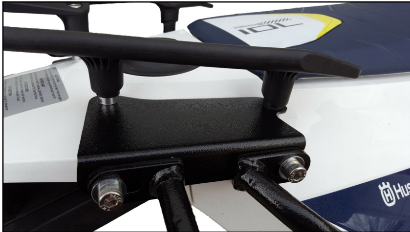
Figure 6: The SU top rear and top front mounts attached to the mounting plates.

Step 5: Attach the upper mounts to the SU mounting plate using the supplied 8x25 SHCS bolts, 8mm washers and 8mm nuts. DO NOT TIGHTEN THE BOLTS AT THIS TIME. See Figures 6-8