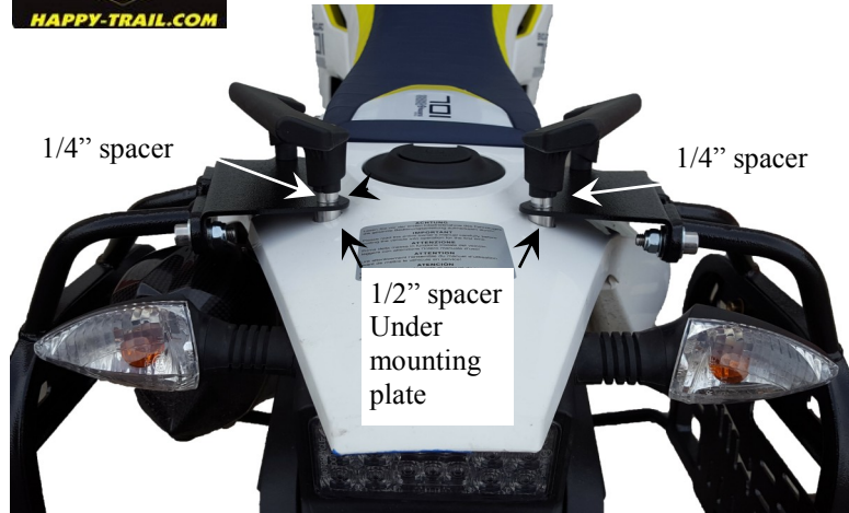
Figure 3: Rear picture showing the grab handles mounted on top of the SU mounting plates.

Step 3: Starting on the left side of the bike (clutch side), Place a 1" tall spacer in the front grab handle mounting point. Place a 1/2" spacer in the rear grab handle mounting point. Place the left SU mounting plate (with the wide top end facing the rear) on top of the spacers as shown in figure 2. Next Place a 1/4" spacer at the rear mounting location, then place the top plate on top and insert an 8x40mm bolt & washer at the front location and a 8x35mm bolt & washer at the rear location. DO NOT TIGHTEN THE BOLTS AT THIS TIME.