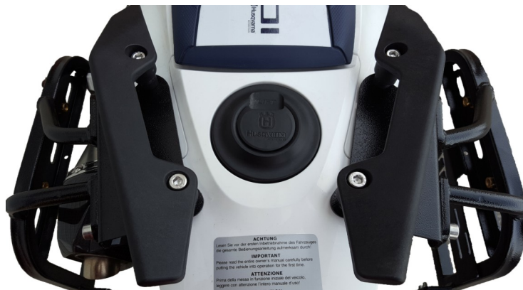
Figure 5: Top view of installed grab handles and rack 2