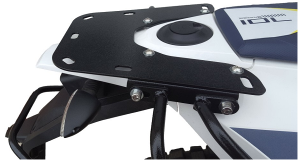
Figure 4: The top plate mounted with the SU rack.